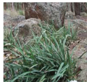
Matted Flax Lily