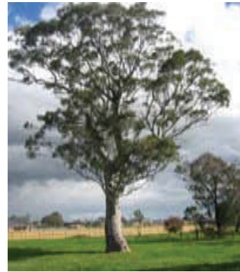
River Red Gum