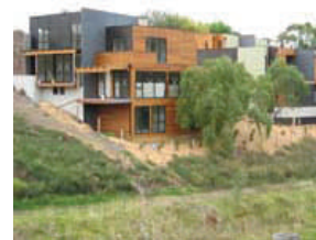
Example of need for screening